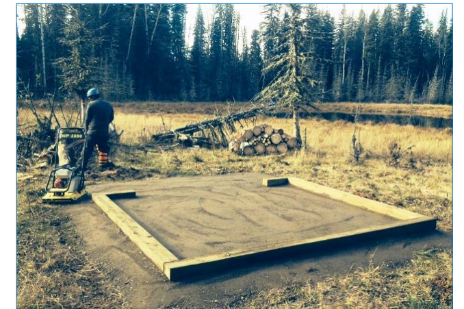
Warming hut site.