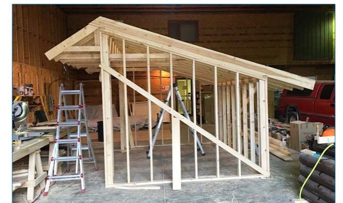
Construction of a warming hut.